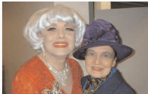
"Carol" with Julie Wilson